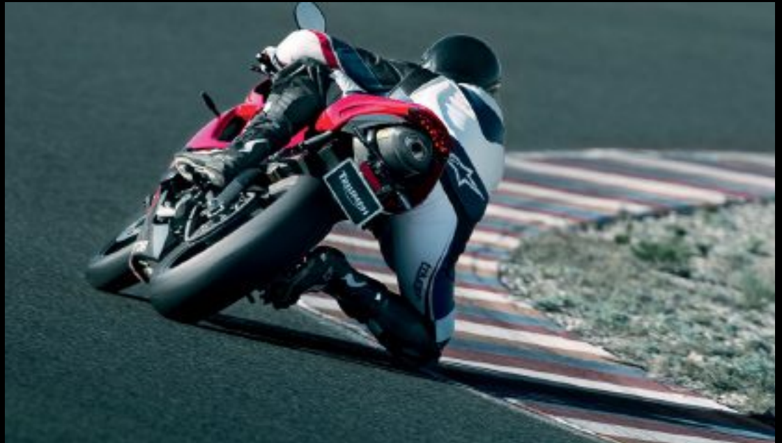
DAYTONA 675 DIABLO RED WITH ACCESSORIES