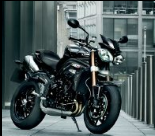
SPEED TRIPLE p6 The original Streetfighter.