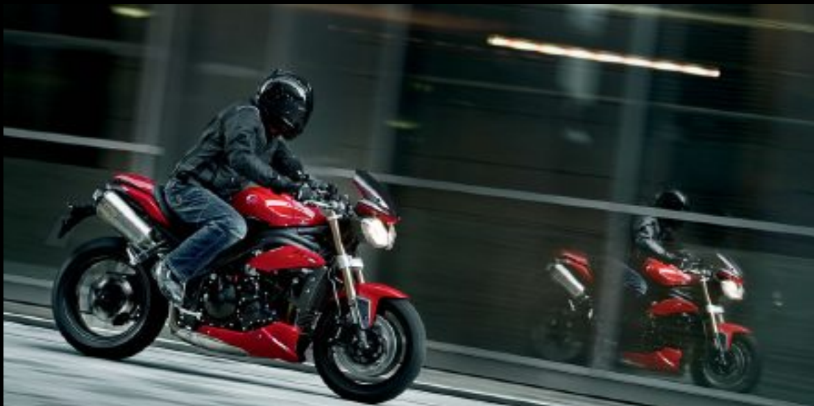
LEFT: SPEED TRIPLE PHANTOM BLACK ABOVE: SPEED TRIPLE DIABLO RED WITH ACCESSORIES