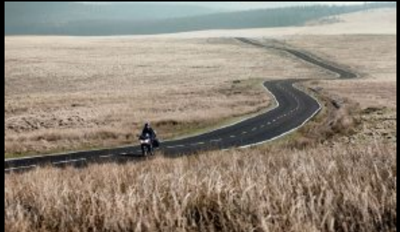
SPRINT GT PACIFIC BLUE WITH ACCESSORIES