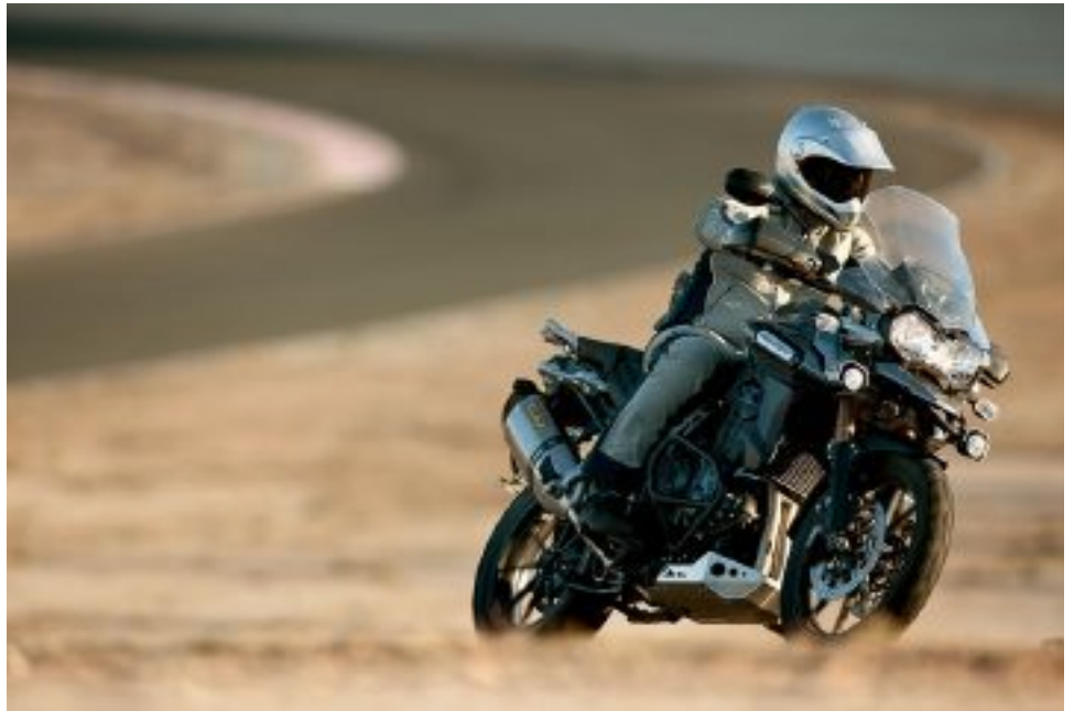
LEFT: TIGER EXPLORER SAPPHIRE BLUE RIGHT: TIGER EXPLORER PHANTOM BLACK WITH ACCESSORIES