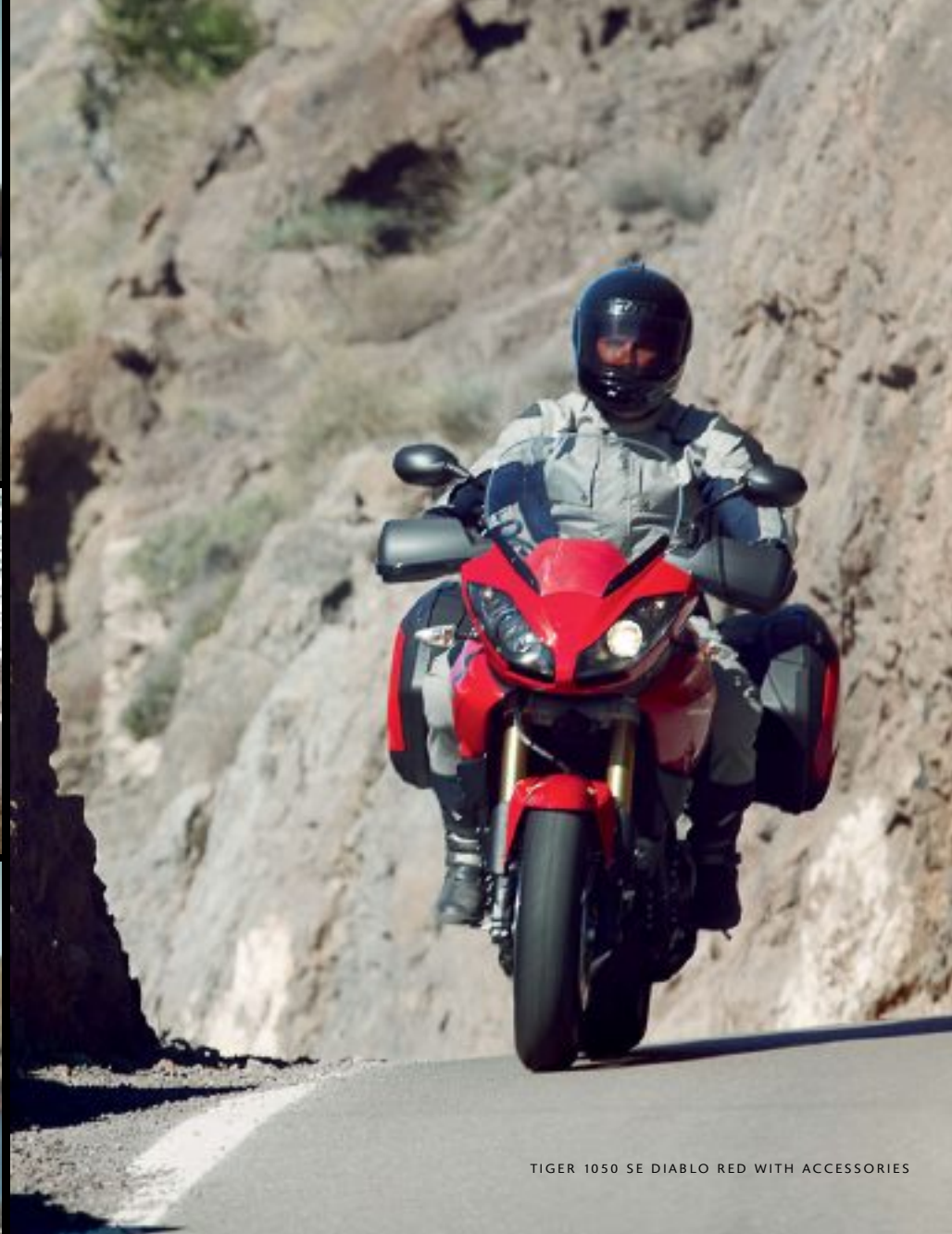
TIGER 1050 SE DIABLO RED WITH ACCESSORIES