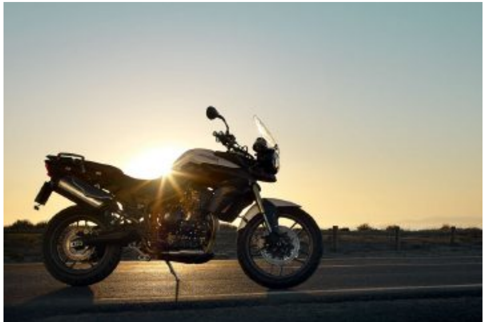
LEFT: TIGER 800 PHANTOM BLACK WITH ACCESSORIES RIGHT: TIGER 800 CRYSTAL WHITE