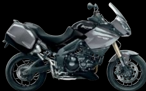
MATTE BLACK / MATTE GRAPHITE