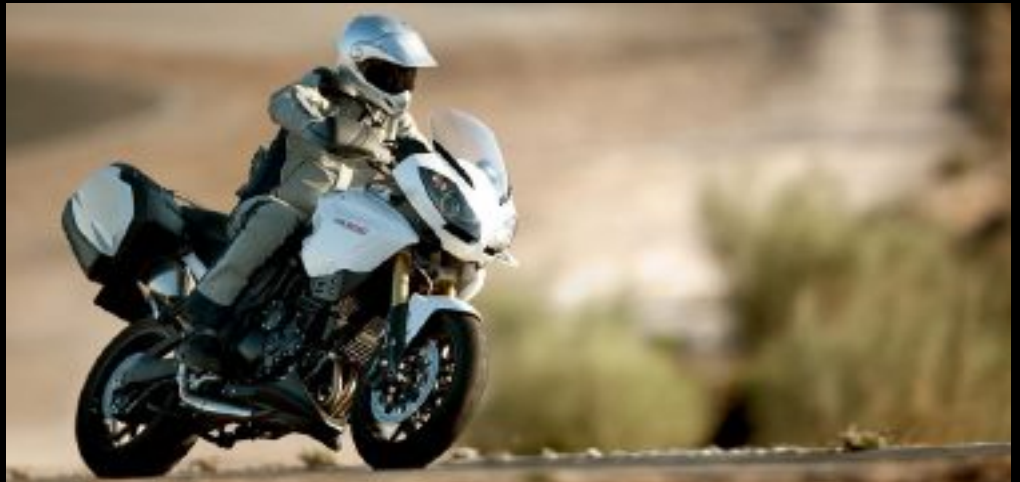
TIGER 1050 SE CRYSTAL WHITE