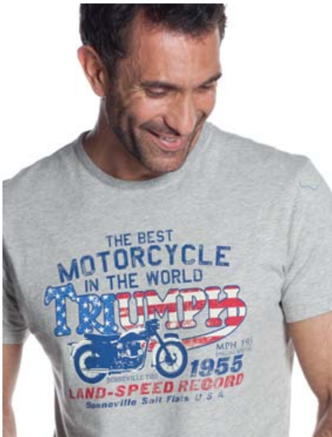
Land Speed T-Shirt 100% cotton single jersey with a pigment print design MSRP $29.99