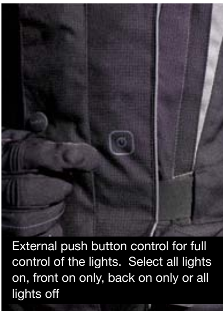
External push button control for full control of the lights. Select all lights on, front on only, back on only or all lights off

Rider wears Sympatex Light Jacket, Sympatex Explorer Pants, Explorer Gloves and AS3 GoreTex Boots