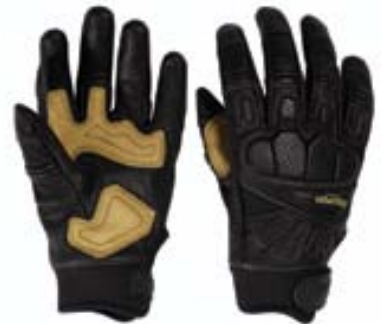
PORTLAND GLOVE MSRP $54.99

Sizes S to XXXL / Long gauntlet adventure waterproof glove for on and off road riding