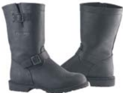
HIGHWAY 2 BOOT MSRP $179.99

Sizes 40 to 47 / Made in England, a classic boot that used traditional craftsmanship developed for the modern rider.