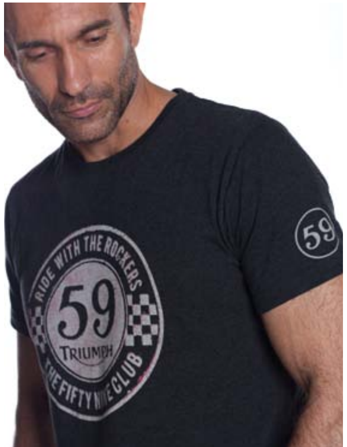
59 Club T-Shirt 100% cotton single jersey with a discharge print design MSRP $29.99