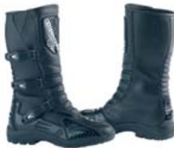
ADVENTURE BOOT MSRP $269.99

Sizes 40 to 46 / Rider Essential entry level touring boot with Tri-Tex waterproof technology / Available as a ladies style