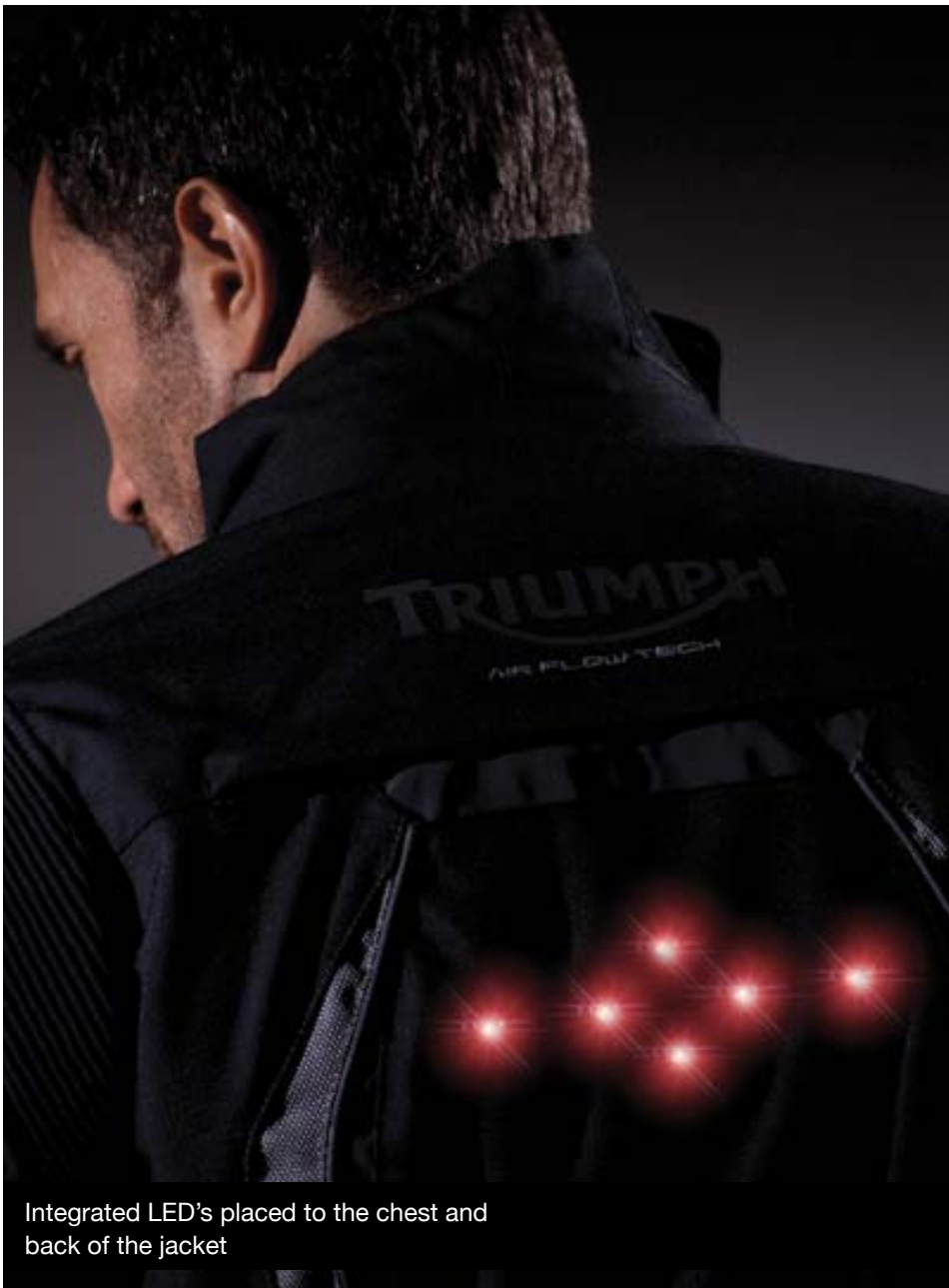
Integrated LED's placed to the chest and back of the jacket