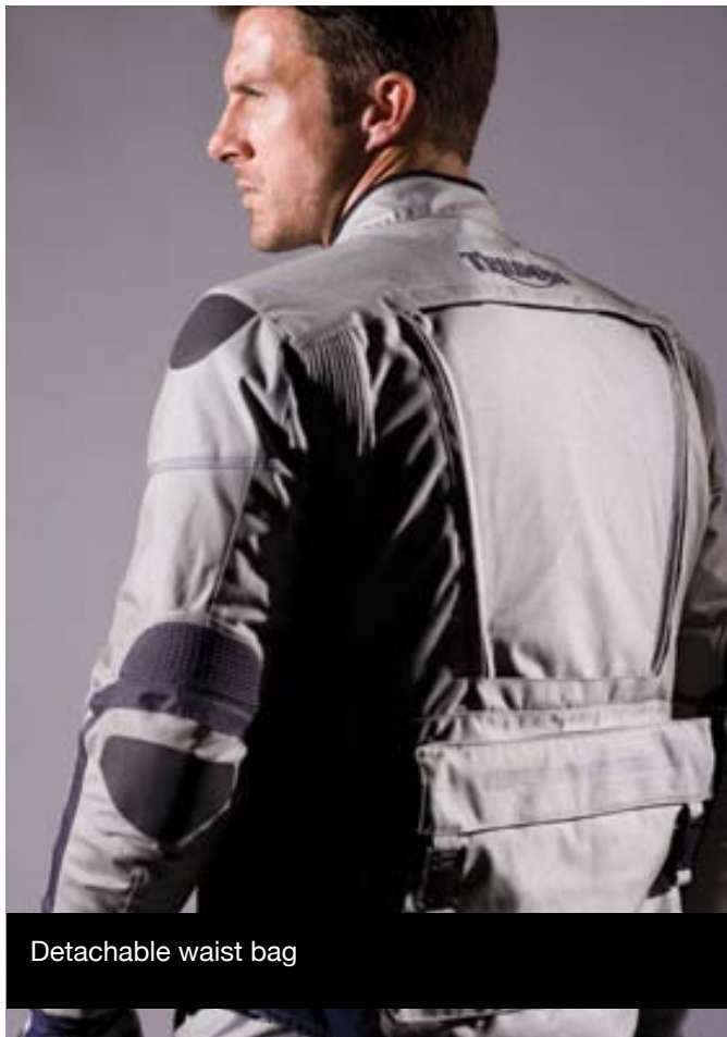
Detachable waist bag