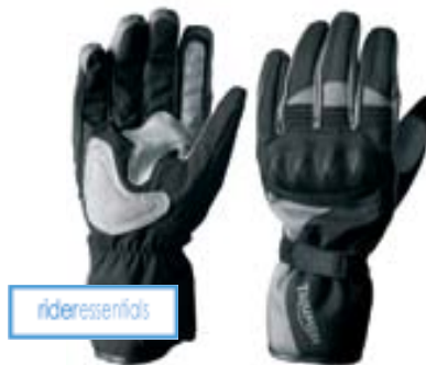
ACTON 2 GLOVE MSRP $49.99

Sizes S to XXXL / High performance sports touring waterproof glove. Available in ladies sizes