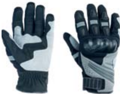
ADVENTURE GLOVE MSRP $89.99

Sizes XS to XXL / Leather and textile waterproof touring glove