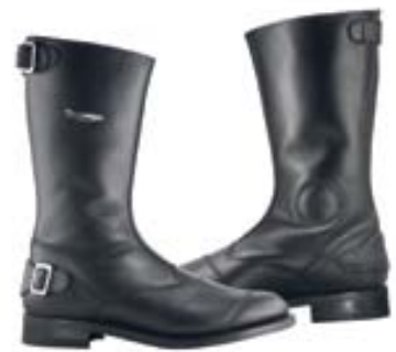
GRATHAM BOOT MSRP $349.99

Sizes 40 to 47 / Enduro inspired boot for on and off road riding / Includes waterproof Tri-Tex membrane technology