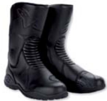
AS3 GORE-TEX BOOT MSRP $235.99

Sizes 40 to 47 / All round waterproof sports boot, developed with Alpinestars /