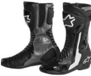
AS1 BOOT MSRP $299.99

Sizes 40 to 47 / Top of the range sports boot with moulded plastic impact panels, developed with Alpinestars / CE approved