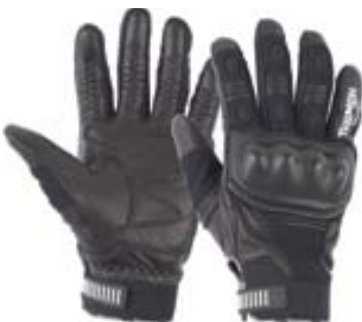
EDMONTON GLOVE MSRP $54.99

Sizes S to XXL / Vintage style glove to combine with any classic jacket.