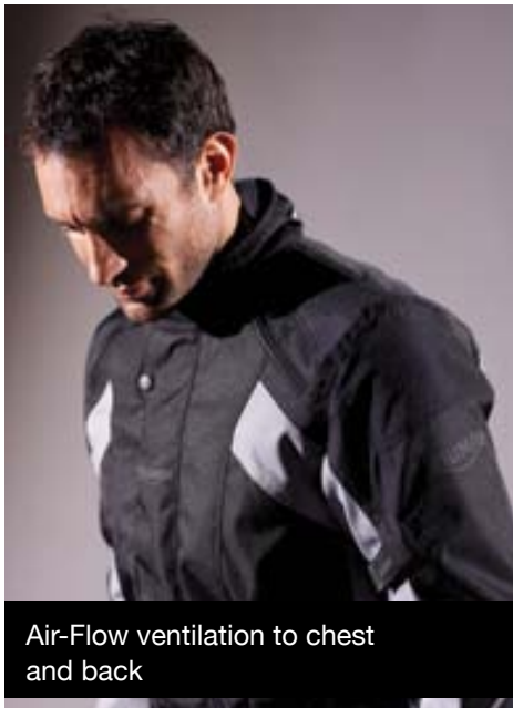
Air-Flow ventilation to chest and back