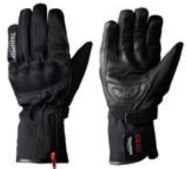
THERMOTEX HEATED GLOVE MSRP $179.99

Sizes S to XXL / High specification sports glove with hard carbon knuckle panels