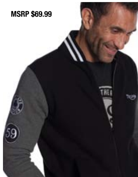
Ace Cafe T-Shirt