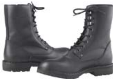
ENGINEER BOOT MSRP $159.99

Sizes 40 to 47 / Traditional styled boot constructed from high grade leather and a non-slip rubber sole / Available as a ladies style