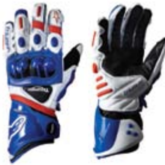
AS7 SPORT GLOVE MSRP $219.99

Sizes XS to XXL / Top of the range track designed sports glove to match the AS7 Suit