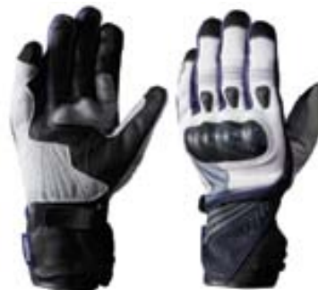
ADVENTURE TOUR GLOVE MSRP $79.99

Sizes XS to XXL / Fully waterproof enduro styled glove