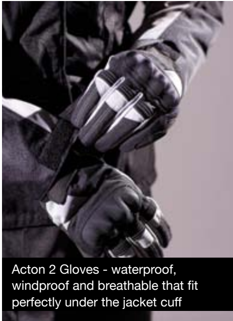
Acton 2 Gloves - waterproof, windproof and breathable that fit perfectly under the jacket cuff