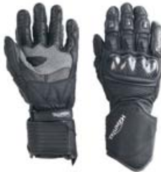
CARBON TECH GLOVE MSRP $119.99

Sizes XS to XXL / Top of the range track designed sports glove to match the AS7 Suit