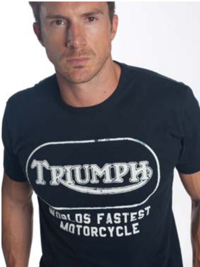
World's Fastest T-Shirt 100% cotton single jersey with a pigment print design MSRP $29.99