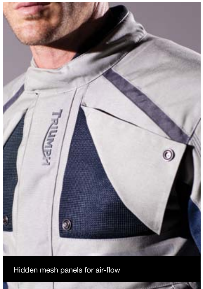
Hidden mesh panels for air-flow