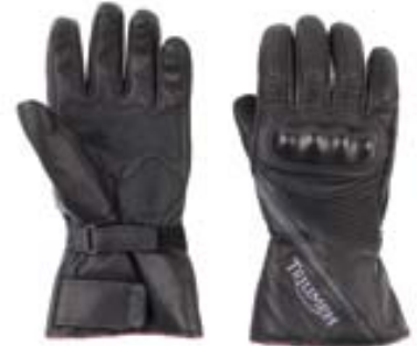
EXPEDITION II GLOVE MSRP $89.99

Sizes S to XXL Rider Essential winter waterproof glove