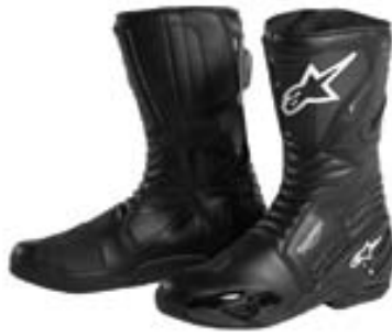
AS2 BOOT MSRP $269.99

Sizes 40 to 47 / Top of the range sports boot with moulded plastic impact panels, developed with Alpinestars / CE approved