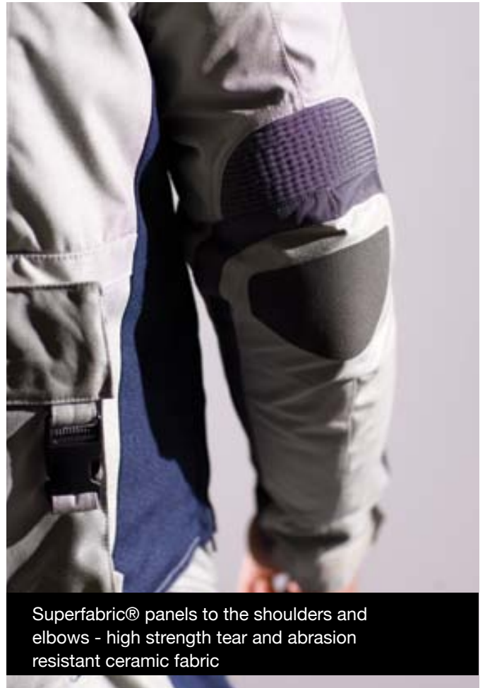
Superfabric® panels to the shoulders and elbows - high strength tear and abrasion resistant ceramic fabric