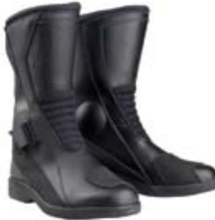
TRI-TEX WATERPROOF BOOT MSRP $169.99

Sizes 40 to 47 / Top of the range Gore-Tex sports touring boot, developed with Alpinestars / CE approved