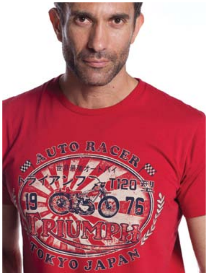
Japanese Auto Racer 100% cotton single jersey with a discharge print design MSRP $29.99