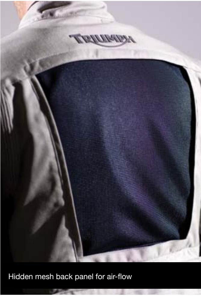
Hidden mesh back panel for air-flow