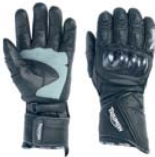
EXPLORER GLOVE MSRP $129.99

Sizes S to XXXL / Connects to the ThermoTex Heated Jacket or worn on its own, containing the EXO2 heat technology