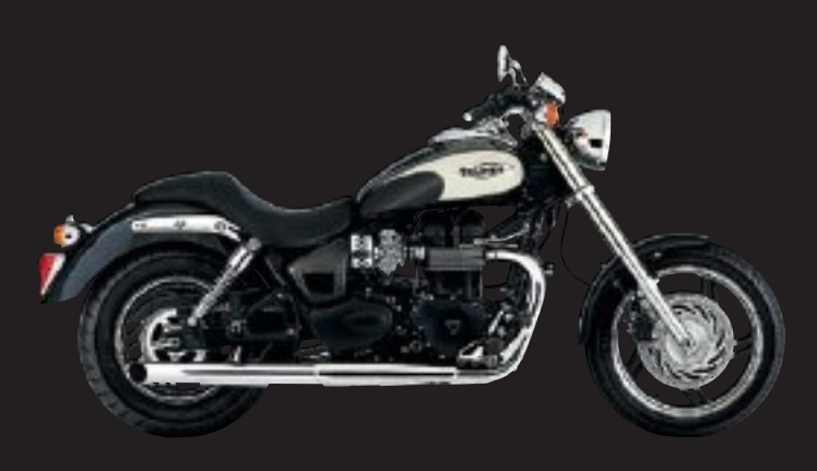
PHANTOM BLACK AND NEW ENGLAND WHITE