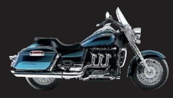
ECLIPSE AND AZURE BLUE