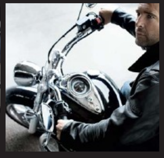
THUNDERBIRD p 12 Triumph's new class leading cruiser. Riding perfection. SPECIFICATIONS p23