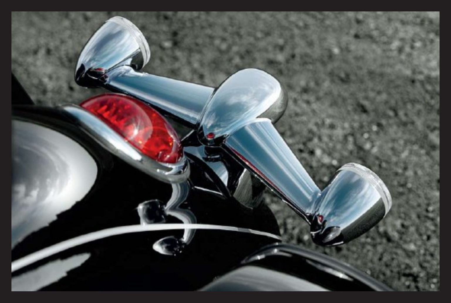
Tuned for low down torque. The rest? It's purposely designed and built to make a great touring motorcycle. High comfort suspension that refuses to compromise on control. A 180 section rear tire and 16 inch wheels for easier handling.