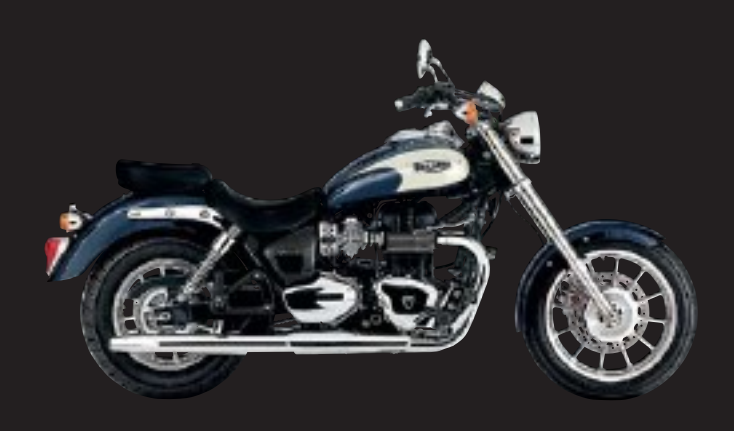
PACIFIC BLUE AND NEW ENGLAND WHITE