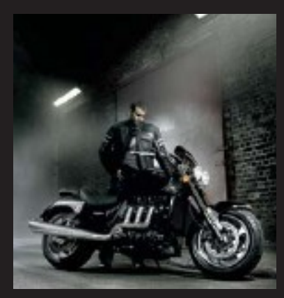
ROCKET III ROADSTER p24 The ultimate in big capacity thrills. A streetfighter on steroids. SPECIFICATIONS p29