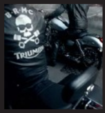
TRIUMPH CLOTHING p36 Whoever you are. Whatever you ride. Whatever the weather. This is the gear. Genuine Triumph clothing.