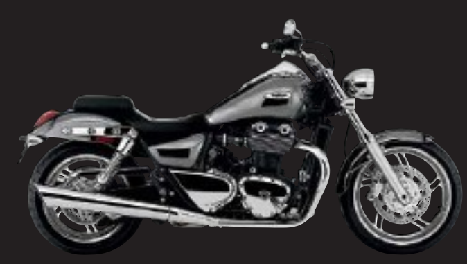
ALUMINUM SILVER WITH JET BLACK STRIPE