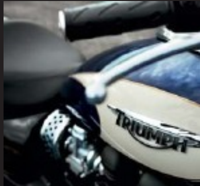
AMERICA p8 British style. American spirit. The distinctive look that delivers laid-back charm. SPECIFICATIONS p11