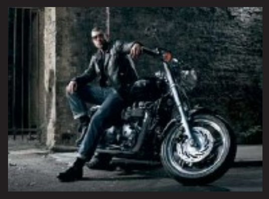
SPEEDMASTER p4 A stripped-down middleweight hot rod. Loves the open road. SPECIFICATIONS p7