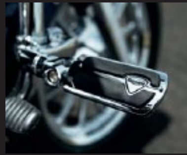
CREATE MY TRIUMPH p39 Create it your way. Exactly your way. By personalizing your Triumph online at triumphmotorcycles.com Any Triumph. Any accessory. Any color.