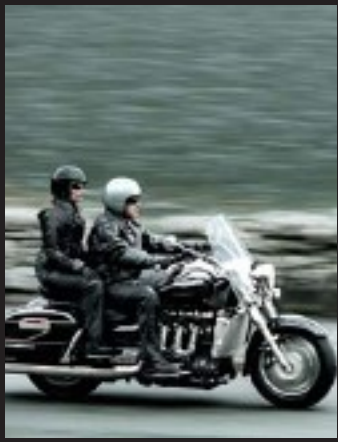
ROCKET III TOURING p30 Sit back, relax and arrive in style. SPECIFICATIONS p35