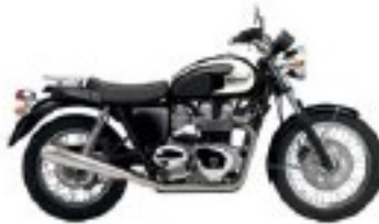
Looking good, sounding even better.