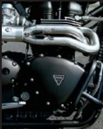
SCRAMBLER p32 No-nonsense 60s attitude. Ready for action. SPECIFICATIONS p37