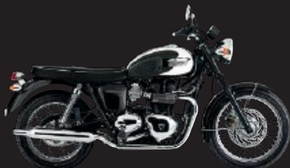
BONNEVILLE T100 JET BLACK AND FUSION WHITE