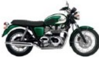
Maybe Green's more you.