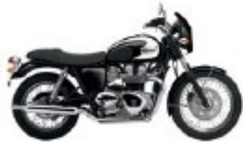
No flies on you.