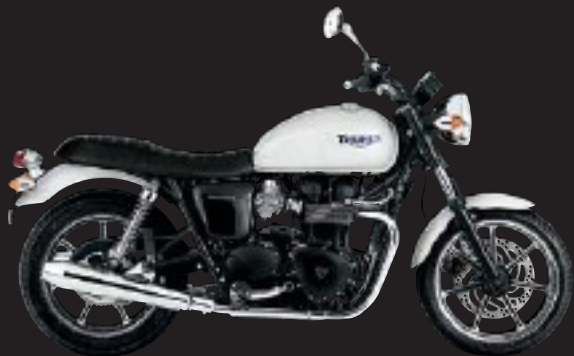
BONNEVILLE FUSION WHITE