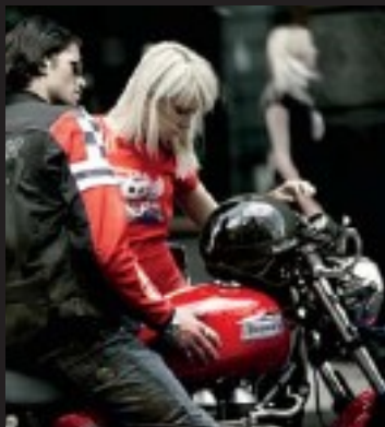
THRUXTON p26 The café racer. Reinvented. SPECIFICATIONS p31