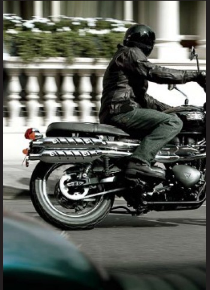
SCRAMBLER JET BLACK