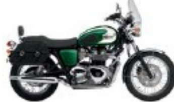
Feel the leather.