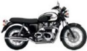
Black as it comes.