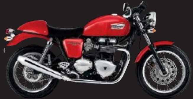
TORNADO RED WITH WHITE STRIPE