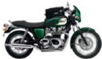
Go the distance.