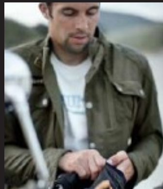
TRIUMPH CLOTHING p38 Whoever you are. Whatever you ride. Whatever the weather. This is the gear. Genuine Triumph clothing.