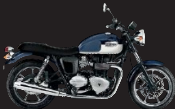
BONNEVILLE SE PACIFIC BLUE AND FUSION WHITE