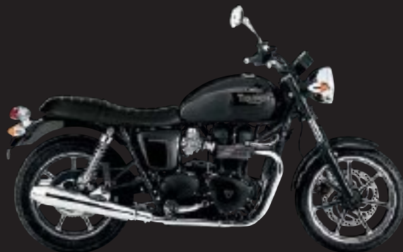
BONNEVILLE JET BLACK