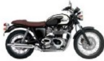
Love your style.