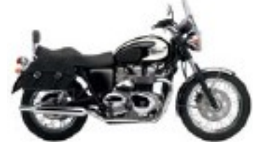
Just the two of us.

Create it your way. Personalize your Triumph by going to "Create My Triumph" online or at your local dealer. This industry-leading configurator allows you to choose any Triumph, in any production color, and see it transformed as you accessorize it as much or as little as you want.