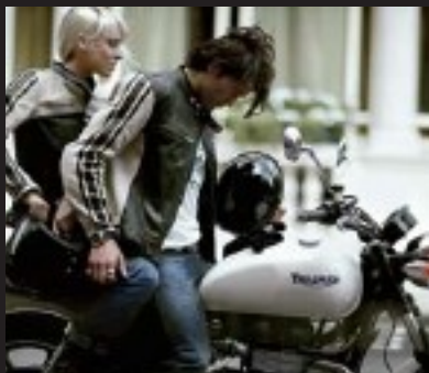
BONNEVILLE p8 An icon. A timeless classic. SPECIFICATIONS p25