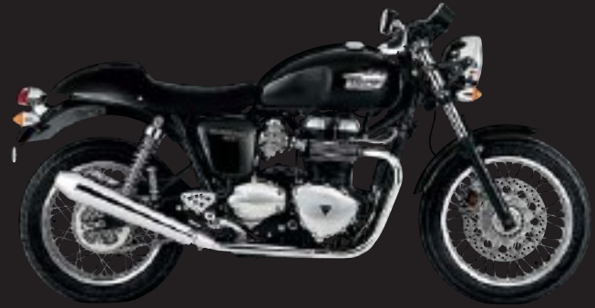
JET BLACK WITH GOLD STRIPE