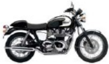
A touch of chrome here, there...