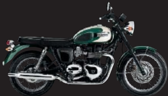
BONNEVILLE T100 FOREST GREEN AND NEW ENGLAND WHITE