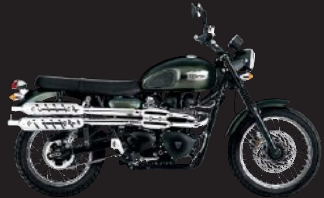
MATTE KHAKI GREEN