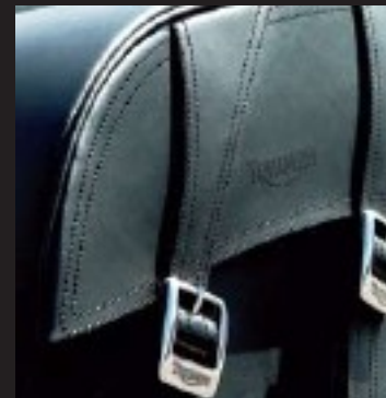
CREATE MY TRIUMPH p39 Create it your way. Exactly your way. By personalizing your Triumph online at triumphmotorcycles.com . Any Triumph. Any accessory. Any color.