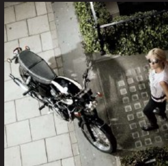
BONNEVILLE T100 p18 Classic styling. Re-engineered for a new century. SPECIFICATIONS p25