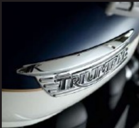
BONNEVILLE SE p14 Extra pure Bonneville. SPECIFICATIONS p25