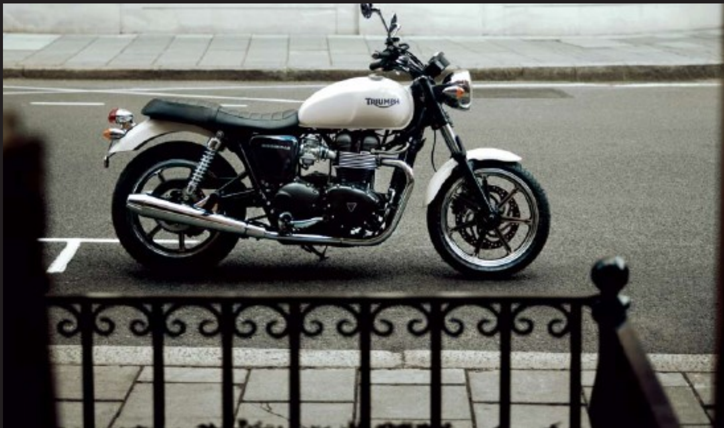
BONNEVILLE FUSION WHITE