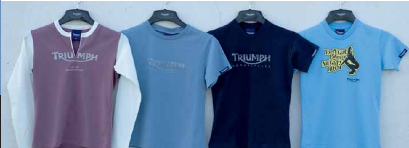
Slit Neck Plum/Ecru Foil Logo Light Blue Spray Logo Navy Every Girl Blue