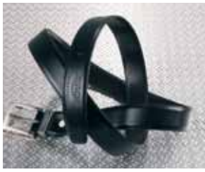
Belt and buckle set M9500403