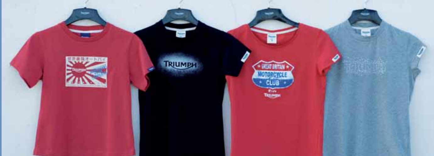
Japan Red Reverse Spray Black Motorcycle Club Red Reverse Stud Grey