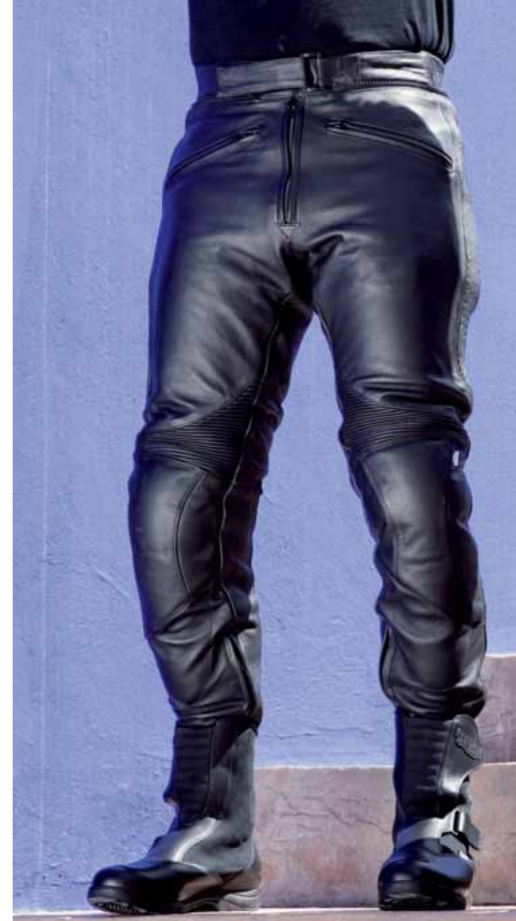
Classic Jeans II 1.2mm leather Removable CE95 protectors – knee Double leather panels – knee and seat Cordura® stretch panels Double stitched impact seams Hip padding Waist connection zipper supplied