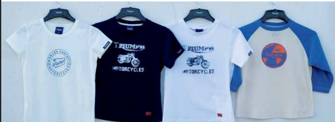
Retro Circle Ecru Dylan T-shirt Navy Dylan T-shirt White Global Ecru/blue