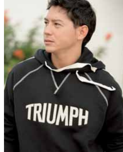
Pullover Hoodie Black