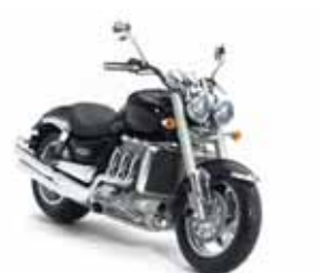
Collectors Limited Edition Rocket III 1:12th die cast scale model Black M2002104-BLK Red M2002104-RED Grey M2002104-GRT