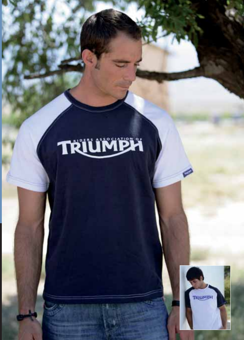
RAT T shirt Navy White

Specially developed with Triumph's own riders in mind, this is a range of clothing for wearing off bike or under your motorcycle kit. The range includes clothing with a high level of technical performance to give you maximum comfort in all riding conditions: Tri-Thermo to keep you warm without the need for bulky layers; Tri-Dri to wick moisture away from the body. Thinking of crossing the Gobi on a sunny day? No sweat.