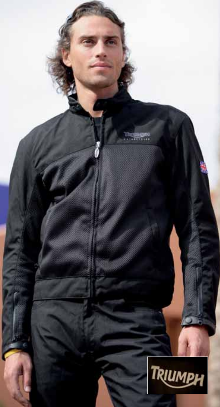
Rochester Mesh Jacket Modern Classics Fully perforated panels and Cordura® construction Removable CE95 protectors – shoulder and elbow Large leather back logo Waist connection zipper supplied