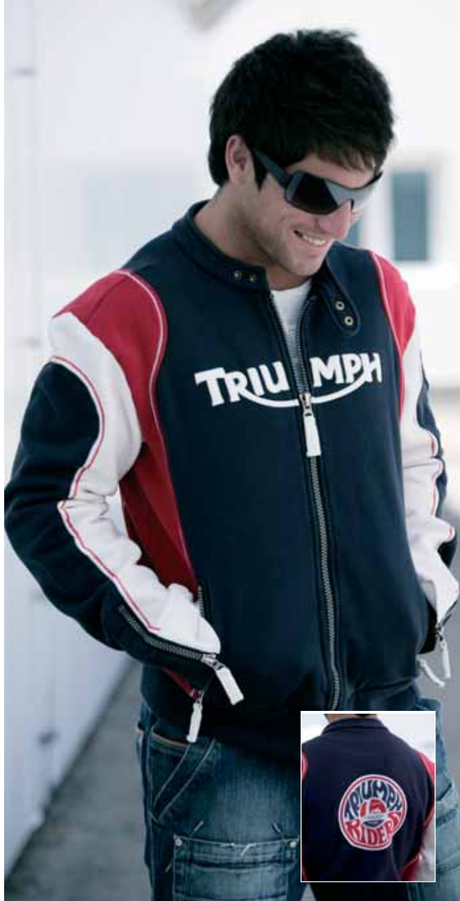
Riders Zip Thru Navy/Red/Ecru