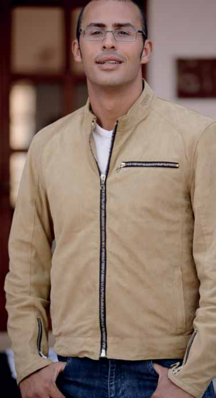
Monclar Jacket Fashion Nubuck leather Multi-colour zippers