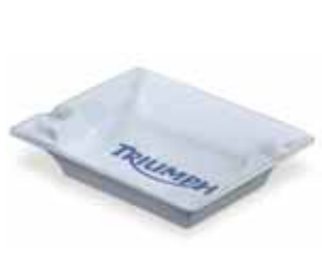
Ashtray #2 M2181005