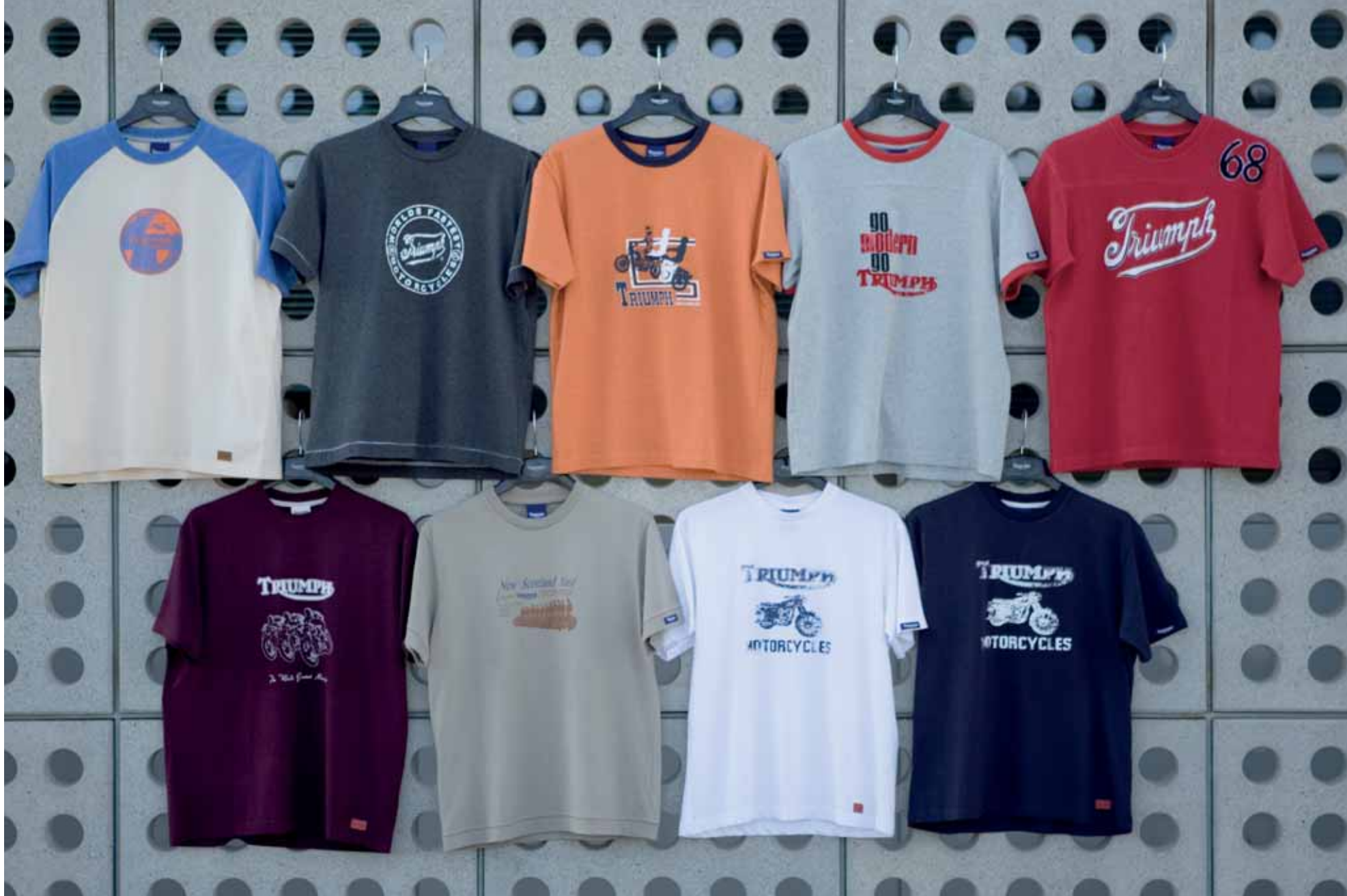
Global Ecru/blue Retro Circle Dark Grey Flying Bike Orange Go Modern Grey Sixty8 Red Deco Burgundy Scotland Yard Taupe Dylan T-shirt White Dylan T-shirt Navy

Triumph's range of vintage sixty8 T-shirts are inspired by classic images from our archive of vintage tees, period ads and posters. With a modern re-mix, these T-shirts are the authentic alternative.