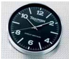
Wall Clock #2 M9401005 300mm Diameter Battery Powered