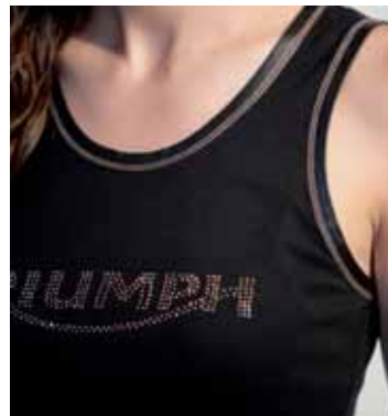
Trim Vest Black