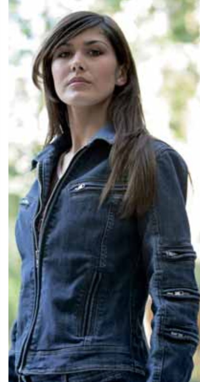
Denim Jacket Modern Classic Ring-spun washed denim outer fabric Keprotec® reinforced panels – shoulder and elbow

Ring-spun washed denim outer fabric Keprotec® reinforced panels – knee and seat Boot cut