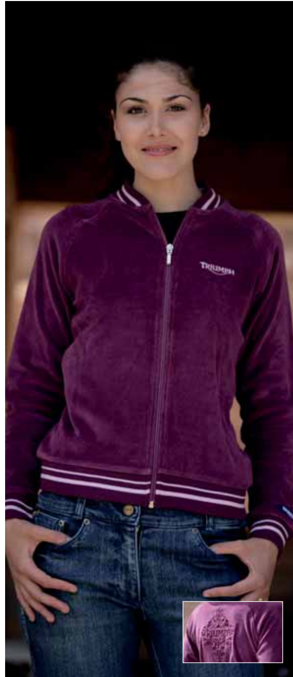
Velour Zip Thru Plum