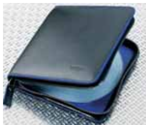
Leather CD Holder M9381305