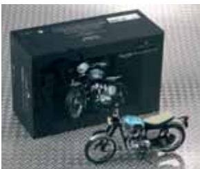
Collectors Limited Edition Bonneville T120 1959 1:12th die cast scale model M2001204