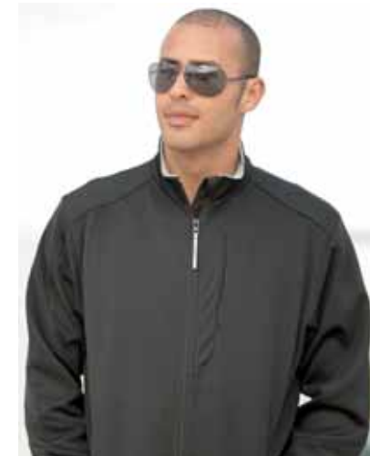
RAT Tri-Thermo Fleece Black