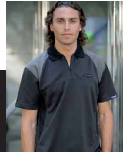
RAT Tri-Dri Polo Black/Grey