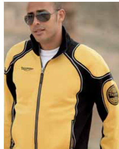
Yellow Zip Thru Yellow/Black