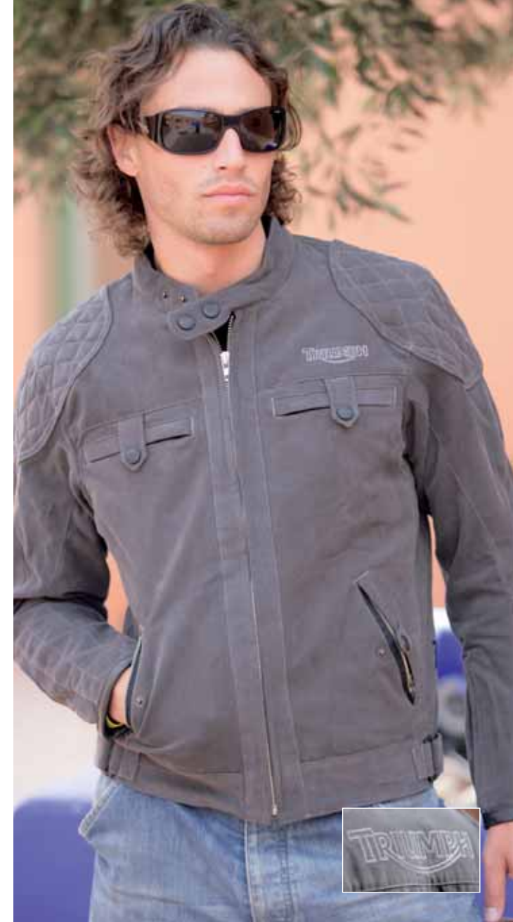
Garrick Jacket Fashion Water repellent outer fabric Stitch detailed back logo Pockets for protectors – shoulder and elbow