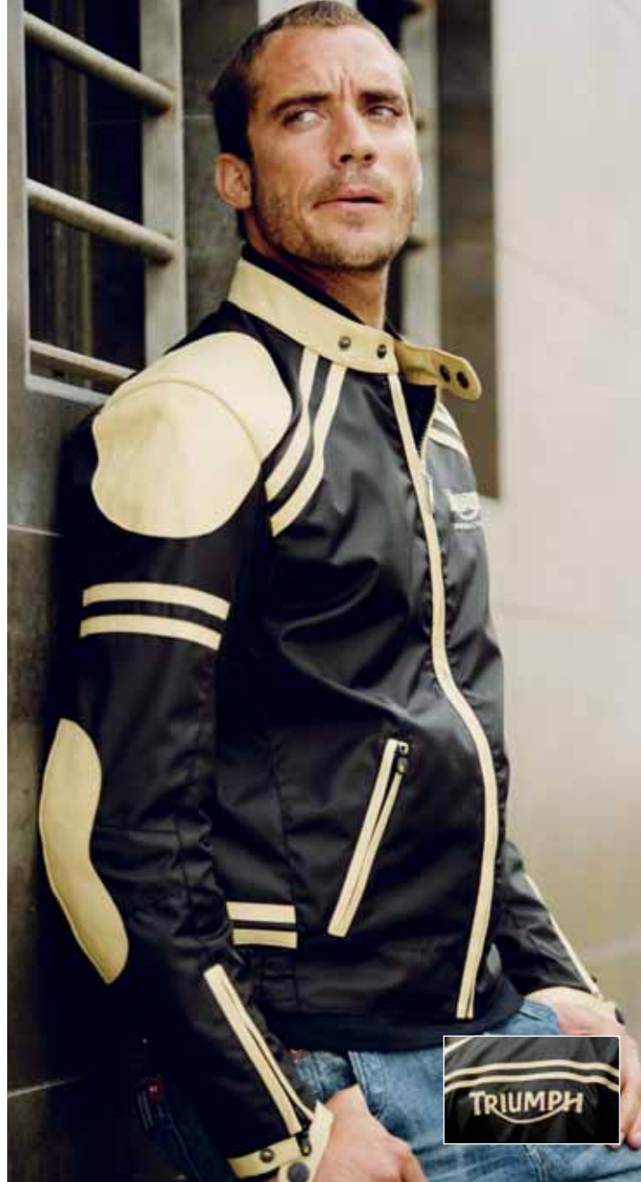
Connaught Jacket Modern Classics Oxford nylon water repellent outer fabric Removable CE95 protectors – shoulder and elbow Large leather back logo Option to fit fleece neck warmer Waist connection zipper supplied