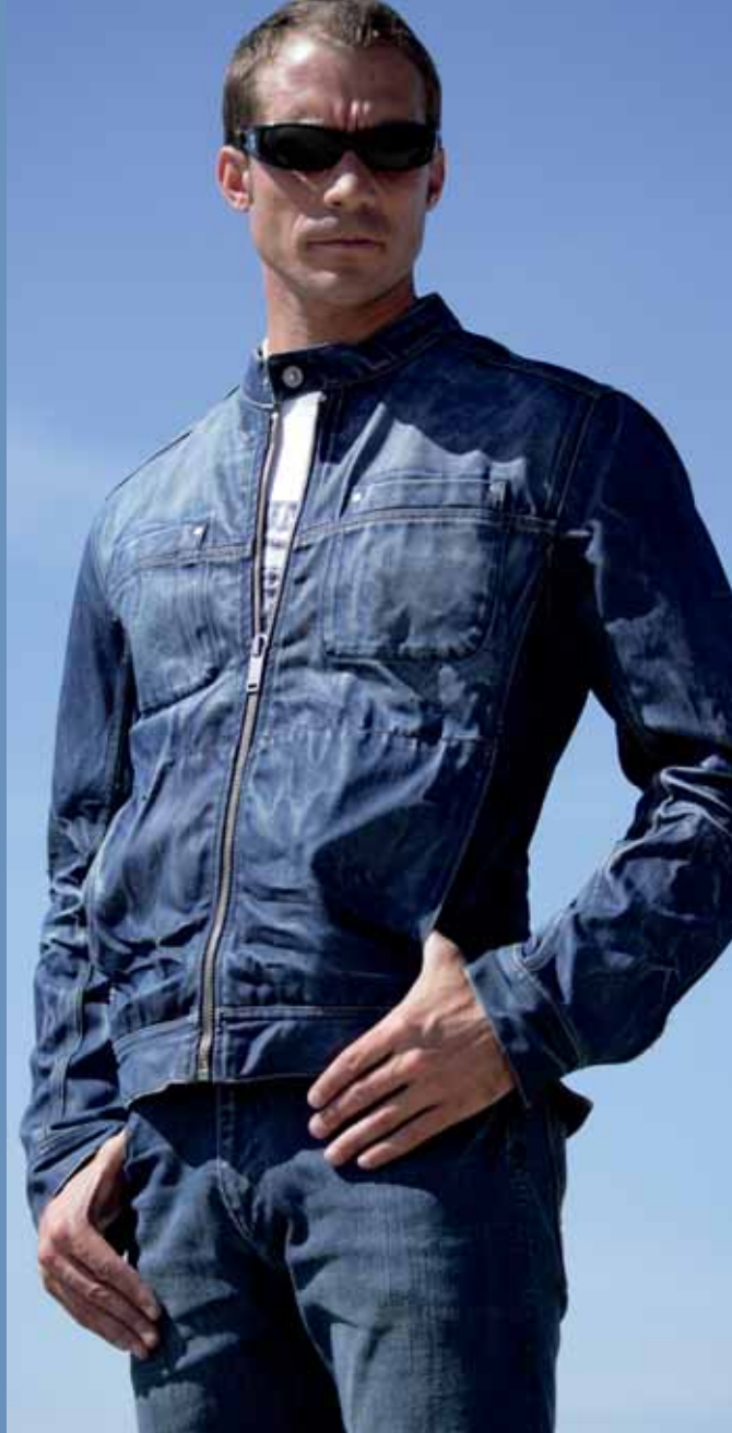
Denim Jacket Modern Classics Ring-spun washed denim outer fabric Keprotec® reinforced panels - shoulder and elbow