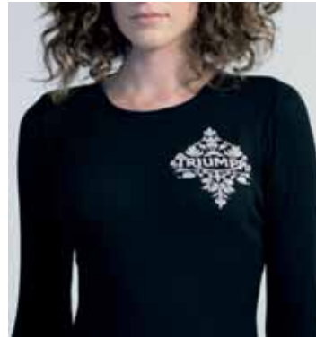
Stretch Rib Black