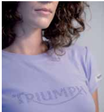
Star Print Lilac