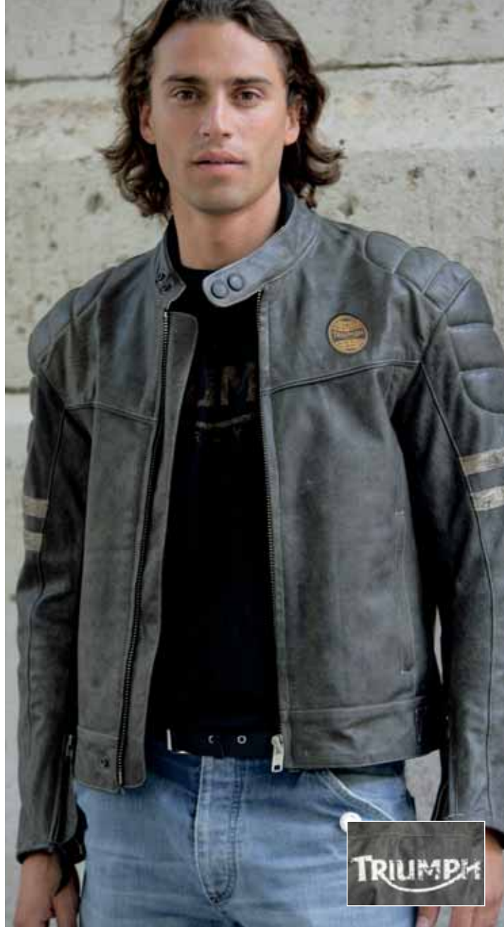
Madison Jacket Fashion Antiqued leather Printed distressed back logo Pockets for protectors