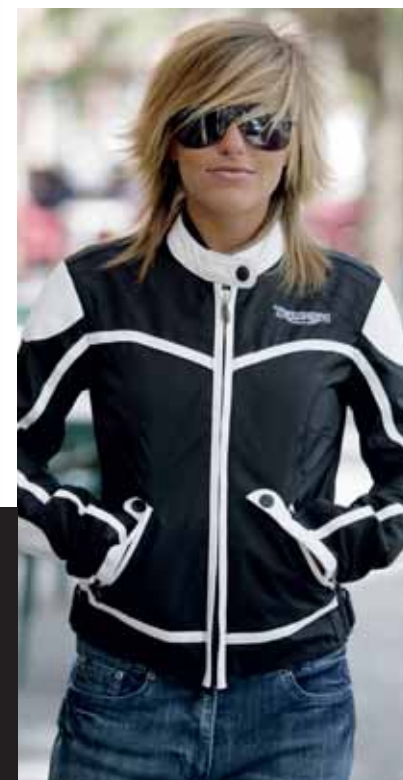
Donna Jacket Modern Classic Oxford nylon water repellent outer fabric Removable CE95 protectors – shoulder and elbow Large leather back logo Waist connection zipper supplied