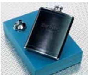
Hip Flask M9502005 Leather Bound