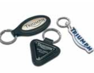
Key Fobs: Triangular M9460095 Rubber #2 M9471005 Oval M9460000