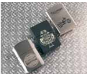
Lighter #11 M9440005-BF Lighter #12 M9440006-FH Lighter #13 M9440006-WP