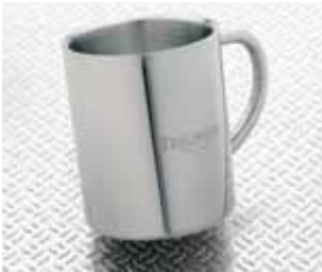
Stainless steel Mug 300ml M9420104