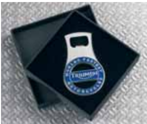
Bottle Opener #2 M9501306