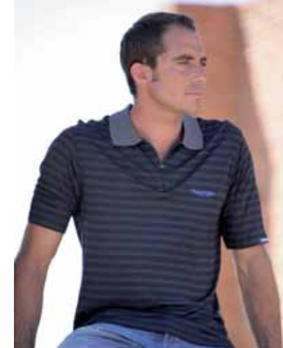
RAT Stripe Polo Grey/Black