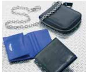
Wallets: Leather Wallet with Chain M9381205 Leather Card Wallet M9381105 Leather Wallet M9381005