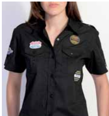
Fashion Shirt Black