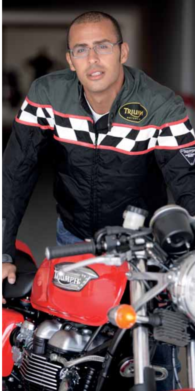
Retro Paddock Jacket Modern Classics Cordura® water repellent outer fabric Removable quilted liner Removable CE95 protectors – shoulder and elbow Hidden ventilation panels Large leather back logo Option to fit fleece neck warmer Waist connection zipper supplied