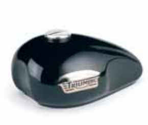
Money Box M2181105 Ceramic