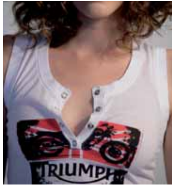
Snap Vest White