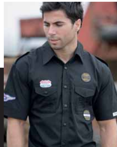
Fashion Shirts Black