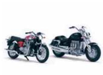
Triumph by Paul Smith Multi Union Bonneville 1:18th die cast scale model M2002205 Rocket III 1:18th die cast scale model M2002306 Variety of models available