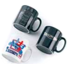
Fabulous Hinckley Mug M2182806 Logo Black Mug M2182606 Flying Bike Mug M2182706