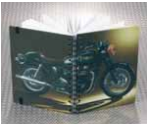
A5 Notebook M9503006