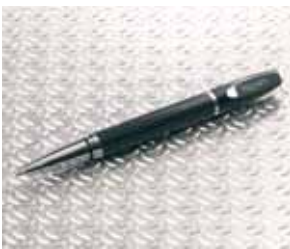
Carbon Ballpoint #2 M8000306