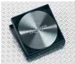
Coasters M9501104 Stainless steel set of 4