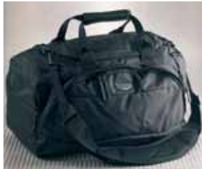
Kit Bag M9343105 40 Litre capacity. Key Lock included