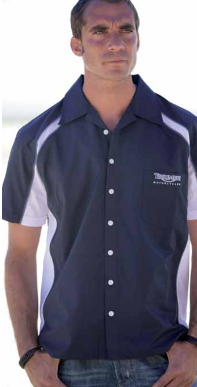
Team Shirt #2 Navy Straight cut fit