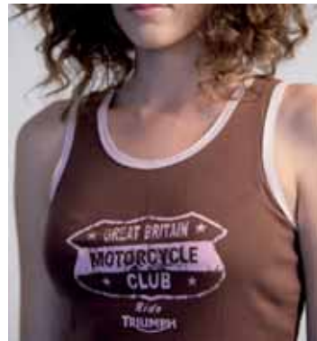
Motorcycle Club Vest Brown